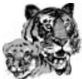
Tiger Cubs BSA